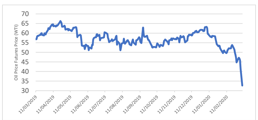
Chart of the week: Oil price collapse