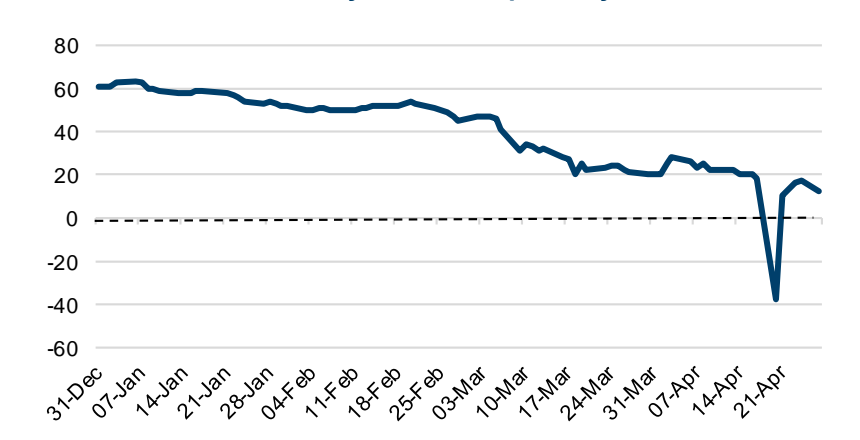
Chart of the week: WTI May Oil futures price – year-to-date